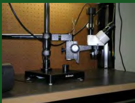
Surface mount Capable