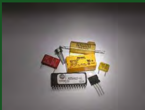
Parts Sourcing Obsolete/hard to find