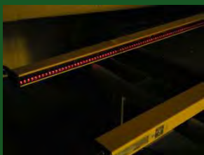
Full range of testing Available